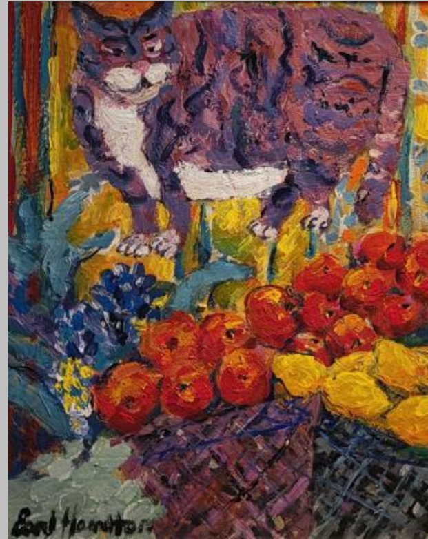
"Purple cat" Earl Hamilton Mixed Media

14 pieces sold in 2022 For a total of $3,905.00